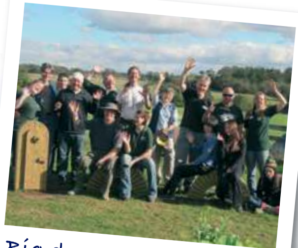
Big draw and working weekend

(b) To ensure farmland is managed sustainably for community benefit with the appropriate management for access, and to research sustainable farming through community land trusteeship, public involvement and other methods.