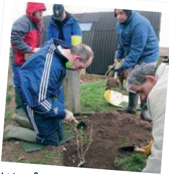
Wayfarers planting fruit