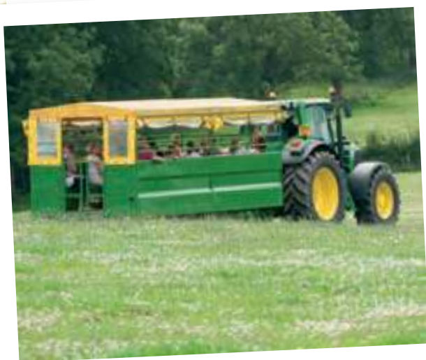
A trip round Fordhall