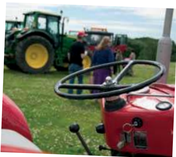
Tractors provide a great attraction for children on farm open days

When Fordhall Organic Farm was saved from development in 2006, we certainly felt the pressure: 8,000 members of our community, both local and further afield, had invested in this farm for the future. They had bought into a vision for the future of farming, and now we had to live up to that vision. We had changed one landlord for 8,000 community landlords.