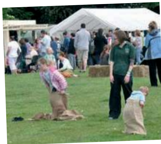
Fordhall summer school

Our next focus went on organising community events on the farm. These varied from story-telling days, to farmers' markets, summer fairs, guided tours and art days. Literally anything we could think of that would encourage our local community to visit and enjoy their time at Fordhall.