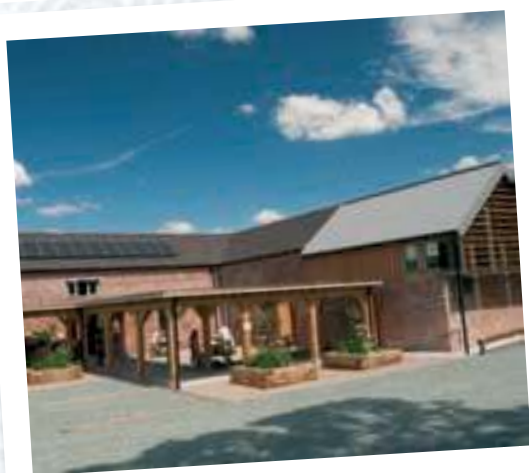
Fordhall June 2011

Fundraising for specific capital projects will continue, but funding to cover our core costs will be generated through enterprise. In 2010 we began our plan to renovate the Old Dairy building. 12 months later and it was open to the public. A sustainably renovated barn complete with Photo Voltaic (PV) panels, a green roof, air source heat pump, hemp walls, sheep's