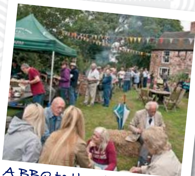
A BBQ to thank our supporters

Success for your community-owned farm will be secured by revisiting your vision on a regular basis and reacting to the needs of your community; ensuring your project remains interesting, diverse, and active. If you can do this you will continue to gain new supporters and you will maintain the interest of your longstanding supporters.