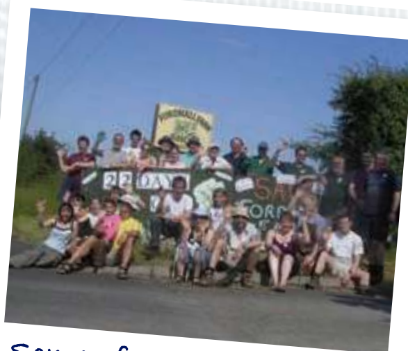
Some of our brilliant volunteers