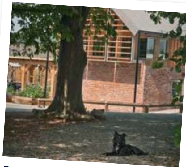
Poppy through the trees