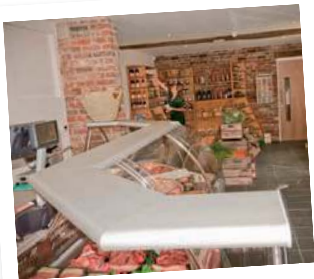
The Fordhall Farm Shop

wool insulation and natural clay paints. The building now holds our office, classrooms, tearoom, restaurant, function rooms, farm shop and butchery. The ability for the FCI to generate its own income is now in full swing.