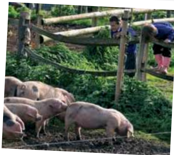
Fordhall farm trail

Everyone likes a feel good story and they will tell others, especially if they feel like they can make a difference. What's your story?