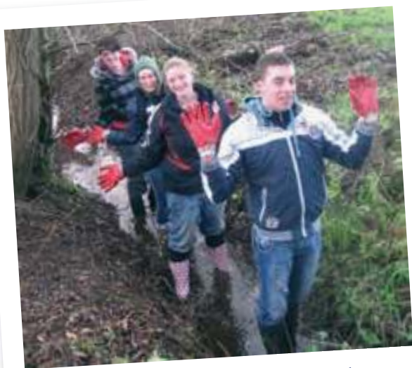
Volunteers at Fordhall

A community-owned farm never stands still, you will never stop learning and the challenges will keep coming – enjoy it.