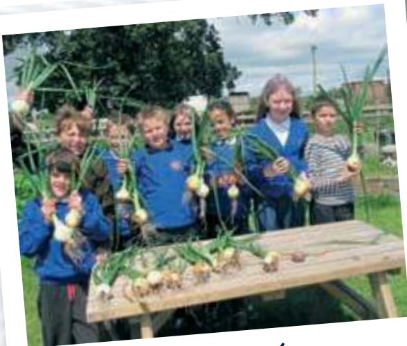
Growing onions in our community garden

The Fordhall community-owned farm engages a 'community of interest' whilst providing land, a house and buildings for a young farmer to rent. Our motivation at Fordhall was to safeguard the land from industrial development and to create a place that reignited the relationship between people, their food and the land it comes from. We wanted to create a place that was educational, brought farm and community together, and created long term security for tenant farmers - a rarity in today's agricultural industry.