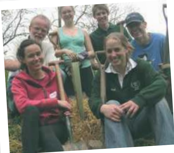
Volunteer tree planting weekend

When we began our fundraising in December 2005 for Fordhall, we had only six months to raise £800,000. At the time we were unaware of the support we may get for our campaign. But as soon as word got out, it seemed to touch a nerve with the general public and the response was overwhelming. We remained positive throughout and we always tried to have fun.