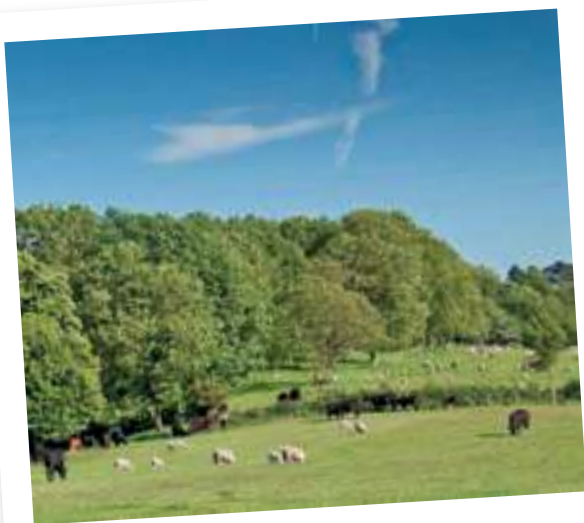
A sunny day at Fordhall

The motivation you have for placing land into community-ownership may vary. Generally it becomes an option when the conventional systems fail to work and the land is placed in jeopardy.