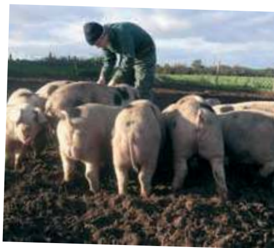
Adam feeding the pigs whilst on work experience

Land values will influence your choice to buy or rent your community farm. But remember, although the land may be expensive for you to buy now, if you are tenants there will always be the chance that the land will be sold to someone else in the future; possibly for housing or industrial development. If you choose to rent land you need to be happy with the level of long term security that it gives your project and your community.