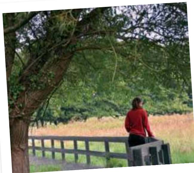
Fordhall morning boardwalk