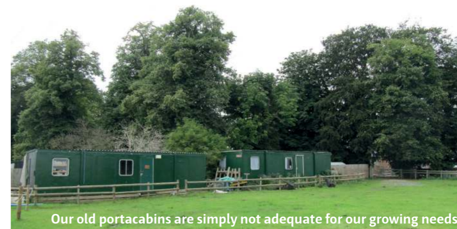
Our old portacabins are simply not adequate for our growing needs.

An appeal to Fordhall shareholders and donors to help create a straw bale bunkhouse to replace the unsightly and draughty porta cabins. We need to support our volunteers and create capacity to expand the educational work of Fordhall. Thousands more school children and adults will be introduced to farm life and sustainable local and organic food. If we can raise £50,000 from individual supporters then we will have the opportunity of receiving a £50,000 fund from the Jean Jackson Charitable Trust. This means each £1 donated by supporters will be worth £2 to Fordhall. The balance of the £550,000 will come from existing secured grants and a crowdfunding appeal.